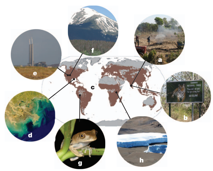
Figure 1 Drivers of a potential planetary-scale critical transition. a, Humans locally transform and fragment landscapes. b, Adjacent areas still harbouring natural landscapes undergo indirect changes. c, Anthropogenic local state shifts accumulate to transform a high percentage of Earth's surface drastically; brown colouring indicates the approximately 40% of terrestrial ecosystems that have now been transformed to agricultural landscapes, as explained in ref. 34. d, Global-scale forcings emerge from accumulated local human impacts, for example dead zones in the oceans from run-off of agricultural pollutants. e, Changes in atmospheric and ocean chemistry from the release of greenhouse gases as fossil fuels are burned. f-h, Global-scale forcings emerge to cause ecological changes even in areas that are far from human population concentrations. f, Beetle-killed conifer forests (brown trees) triggered by seasonal changes in temperature observed over the past five decades. g, Reservoirs of biodiversity, such as tropical rainforests, are projected to lose many species as global climate change causes local changes in temperature and precipitation, exacerbating other threats already causing abnormally high extinction rates. In the case of amphibians, this threat is the human-facilitated spread of chytrid fungus. h, Glaciers on Mount Kilimanjaro, which remained large throughout the past 11,000 yr, are now melting quickly, a global trend that in many parts of the world threatens the water supplies of major population centres. As increasing human populations directly transform more and more of Earth's surface, such changes driven by emergent global-scale forcings increase drastically, in turn causing state shifts in ecosystems that are not directly used by people.

and human population growth<sup>27,30</sup>—are also primary forcings today. During the last glacial–interglacial transition, however, these were probably separate, yet coincidental, forcings. Today conditions are very different because global-scale forcings including (but not limited to) climate change have emerged as a direct result of human activities.